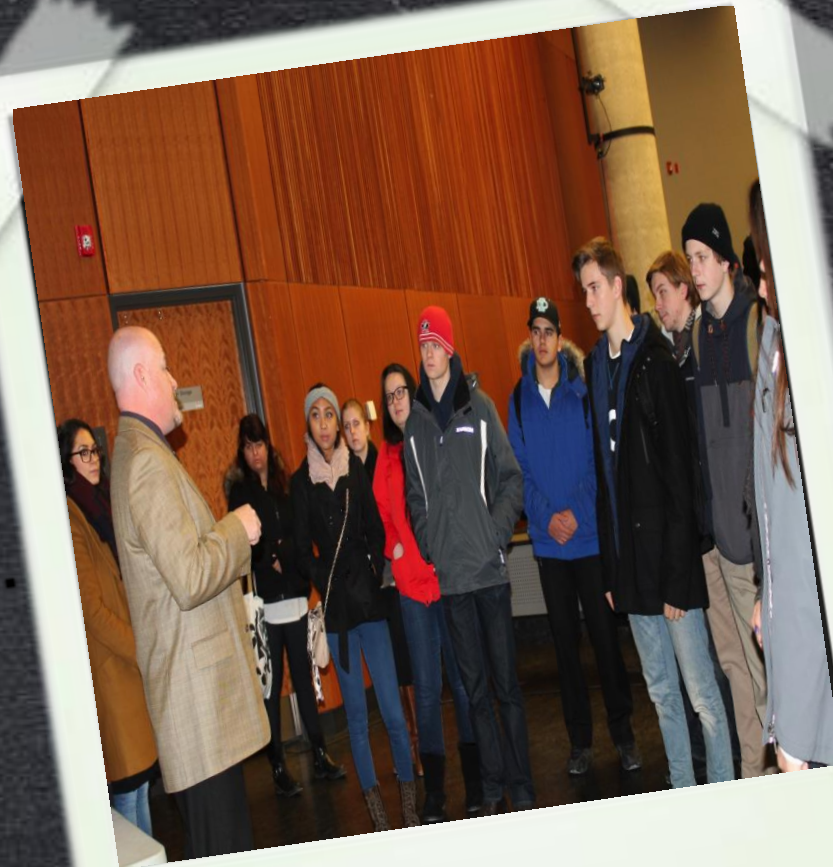
University of Toronto